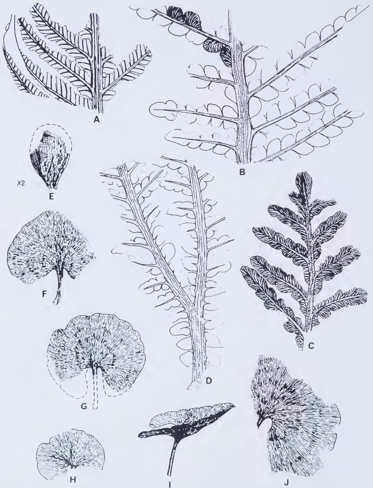
Figure 3. Fossil seed ferns and problematica from Culvida Soak; A, Lepidopteris madagascariensis (F9148); B-D, Dicroidium zuberi (F9151, F9143, F9152 respectively); E, Umkomasia sp indet (F9147); F-J, Chiropteris whitei (F9159, F9158, F9150, reconstructed leaf, F9156 respectively).